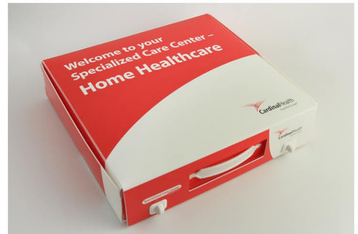
.055ga White PE Screened 2/0 with Twist Latches