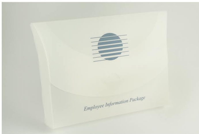
.030ga Clear PP Screened 1/0 - Custom Shape