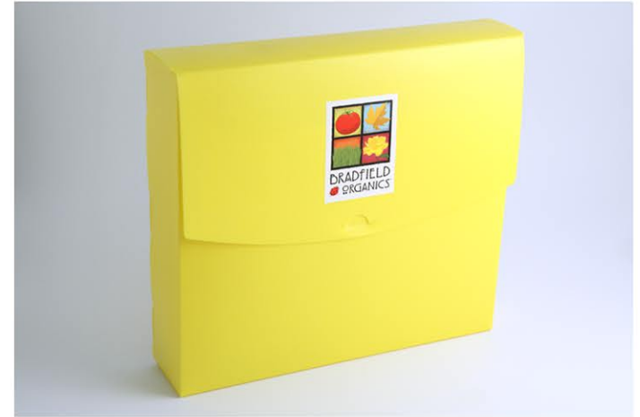
More Secure Assembly

Can be screen printed, digitally printed, or offset printed for a customized, unique look.