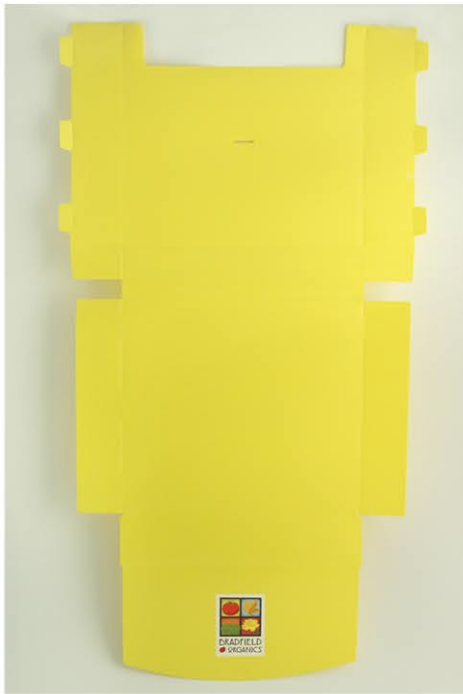
.035ga Yellow PE Screened 4CP + White

Closure options: tuck lock, velcro, snaps, or latches.