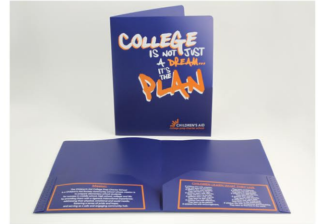
School Folder - Scr 2/0.

APPLICATIONS: School Planners, School Info Kits, School Folders, University Recruitment Kits, Training Manuals, & New Employee Kits.