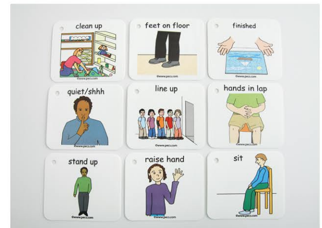
Learning Tool for Children with Special Needs - Screened 4CP/0.