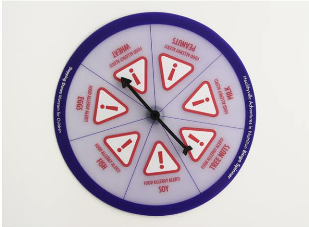
Food Allergy Spinner Learning Tool - Scr 3/0.