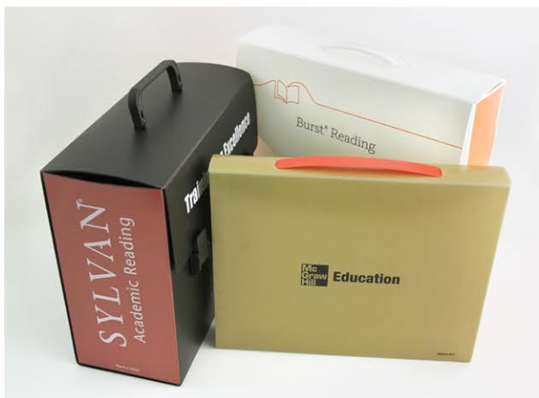
Toteboxes - Screen Printed.

APPLICATIONS: School Planners, School Info Kits, School Folders, University Recruitment Kits, Training Manuals, & New Employee Kits.