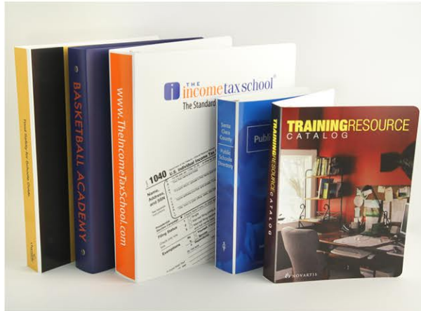
PE Binders - Screened & Digitally Printed.