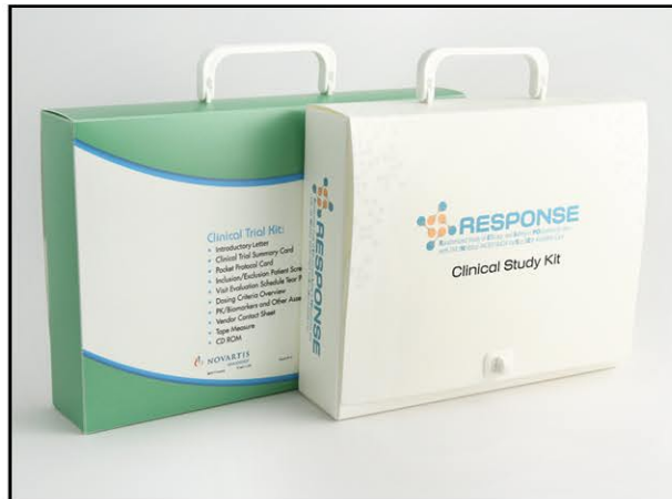
Boxes - study and sales kits.