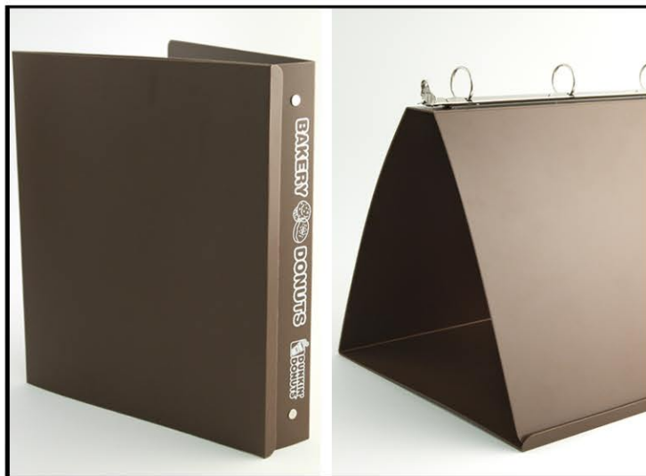
Recipe & Procedural Storage Tools