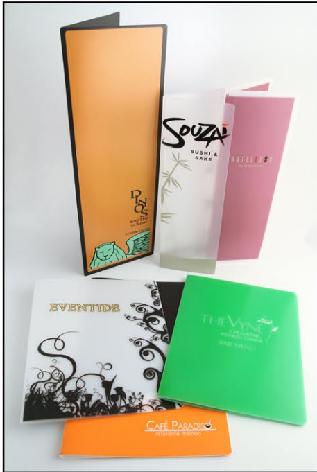
Food & Drink Menu Covers

APPLICATIONS: Menu Covers, Appetizer, Dessert & Drink Binders, Recipe Storage, Instructional & Operation Manuals, Food Safety Guidelines, Franchise Kit, Safety & Promotional Signage.